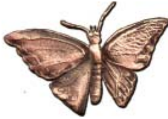
BUTTERFLY BR 165