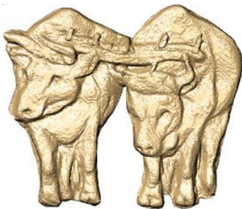
BULLOCK TEAM BR 140