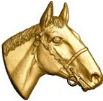
HORSE HEAD BR 111