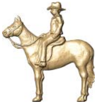
MAN ON HORSE BR 398