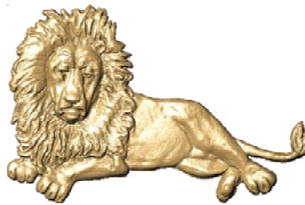
LION BR 4261