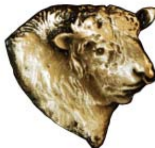
BULL POLLED BR 301