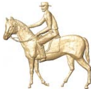
MAN ON HORSE BR 362