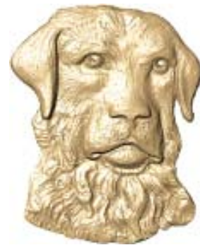
DOG - LABRADOR BR 190