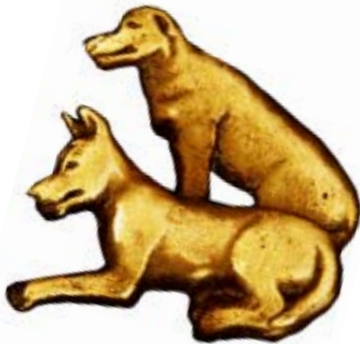
DOGS BR 363