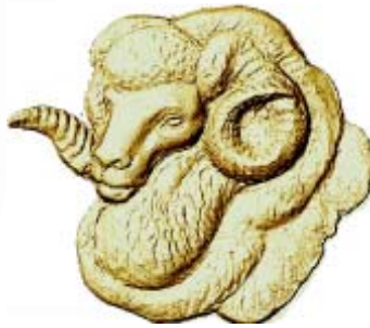
RAMS HEAD BR 369