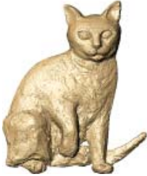
CAT - GENERAL BR 198