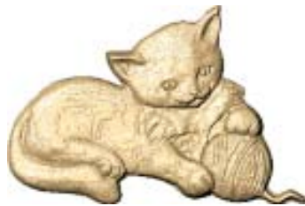
KITTEN BR 391