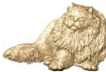
CAT - PERSIAN BR 189