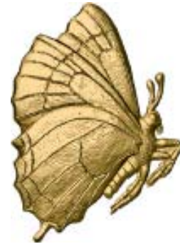
BUTTERFLY BR 164