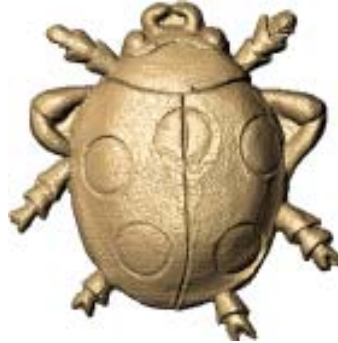
BEETLE BR 141