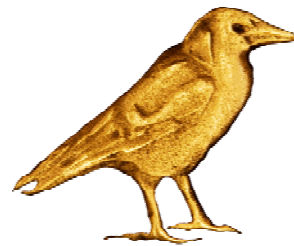
MAGPIE BR 142