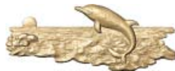
DOLPHIN BR 192