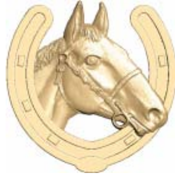
HORSE HEAD AND SHOE BR 151