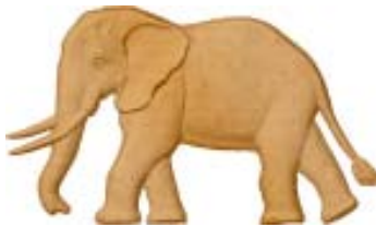
ELEPHANT BR 158