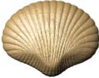
SEA SHELL BR130