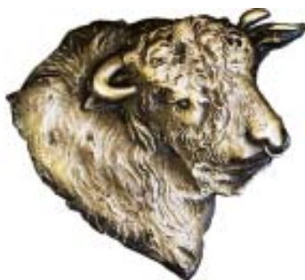
BULL HORNED BR 191