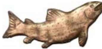
FISH BR 131