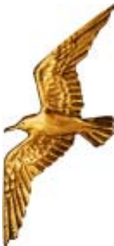
BIRD BR 390