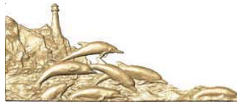
DOLPHINS WITH LIGHTHOUSE BR 4251